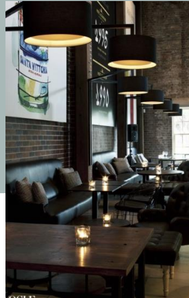
WINE TASTING LOUNGE